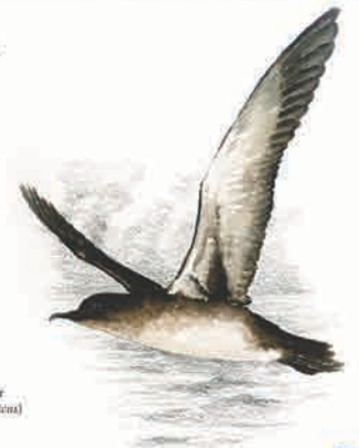
Balearic shearwater ( Puffinus mauretanicus )

During the summer, and after a long journey from the Mediterranean, these waters receive an exceptional visitor, the Balearic shearwater , the most threatened bird in Europe, which meets with the European shags forming small puddles to fish in the ria.