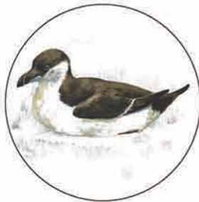
Razorbill ( Alia torda )