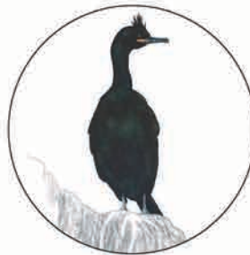
European shag ( Phalacrocorax aristotelis )