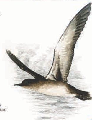
Balearic shearwater ( Puffinus mauretanicus )

During the summer, and after a long journey from the Mediterranean, these waters receive an exceptional visitor, the Balearic shearwater , the most threatened bird in Europe, which meets with the European shags forming small puddles to fish in the ria.