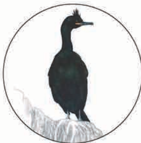
European shag ( Phalacrocorax aristotelis )