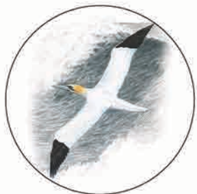
Northern gannet ( Morus bassanus )

Santa Cruz cove is a wintering area for seabirds such as divers , common scoters , razorbills or common murrens that visit us from northern Europe. In the migratory paths and during the winter, it is easy to see northern gannets and occasionally some Scopoli's shearwater or a great skua in the waters of the middle of the estuary. We can also see, either perched in the Corval of Santa Cruz or diving in search of fish, groups of European shags that have here one of the main places of Galicia.